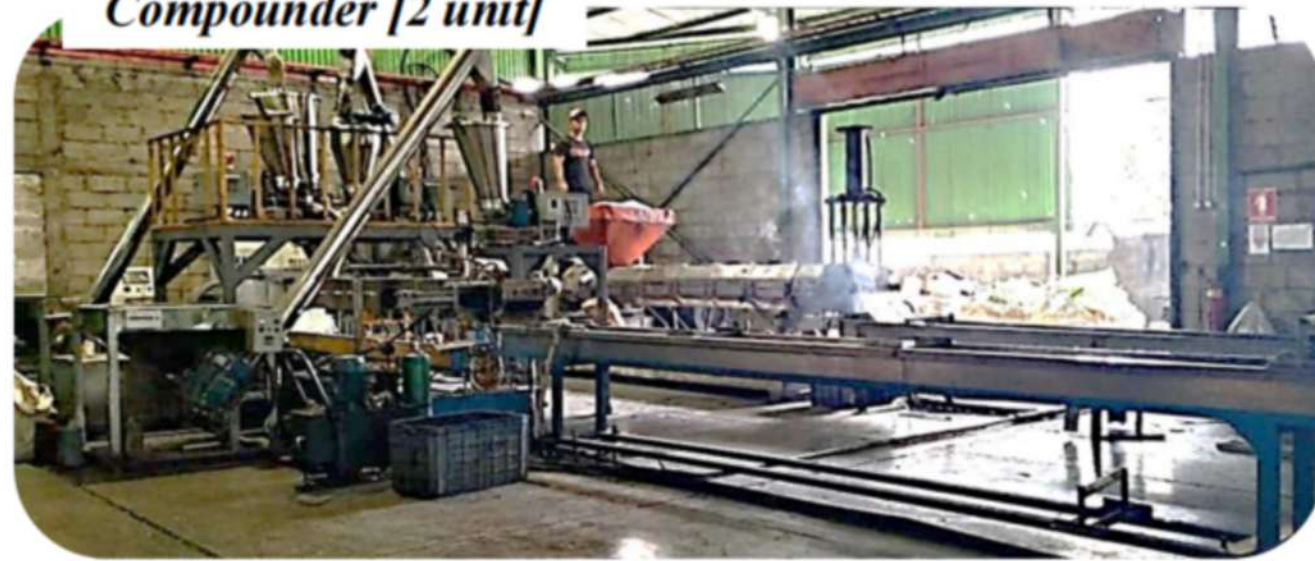
Compounder [2 unit]